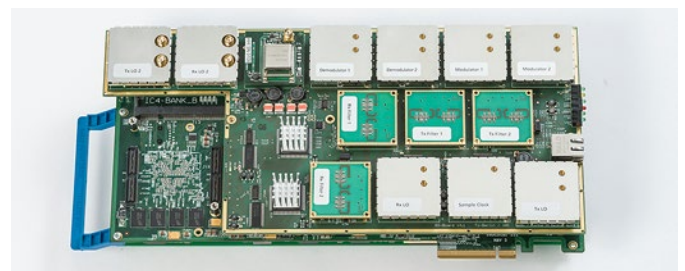
HIRATE transceiver board equipped with plug-on modules

The demonstration shows that it is worth accepting the challenge. The setup is based on HIRATE – a modular testbed developed at the Fraunhofer Heinrich Hertz Institute. It enables the implementation of various wireless transmission concepts and signal processing algorithms. The system combines flexible FPGA-based high performance digital signal processing capabilities with wideband RF front-ends in a compact 19" chassis.